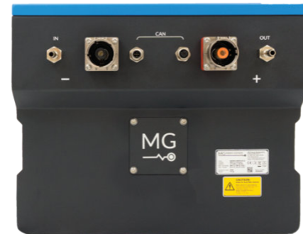
RS battery modules 44 V up to 88 V

High safety and flexible system configurations were the design principles during the development of the RS series Lithium-Ion battery. A modular and compact design makes system integration more flexible, especially in retrofit projects. Adding a redundant BMS and a unique cell-to-cell propagation protection takes safety to the next level. The liquid thermal management keeps the battery cells on temperature to extend cycle life and to improve the peak power performance. These features make this battery suitable for large energy storage applications as well as small peak power packs in hybrid solutions.